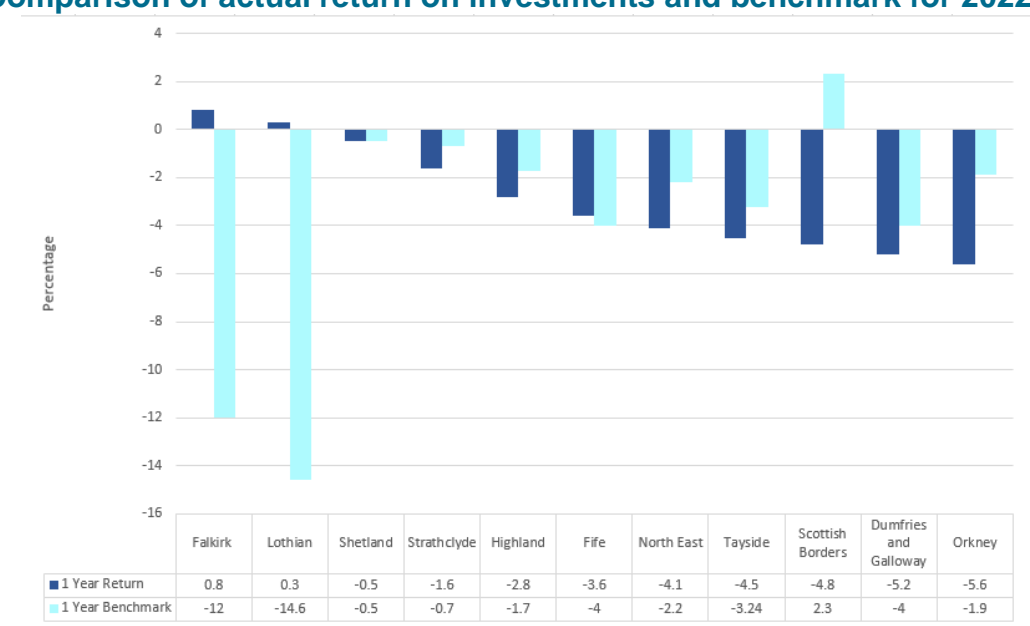
Exhibit 9 Comparison of actual return on investments and benchmark for 2022/23